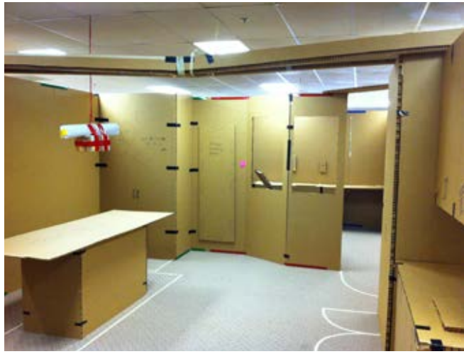
X-Ray mockup with door swings and clearances indicated