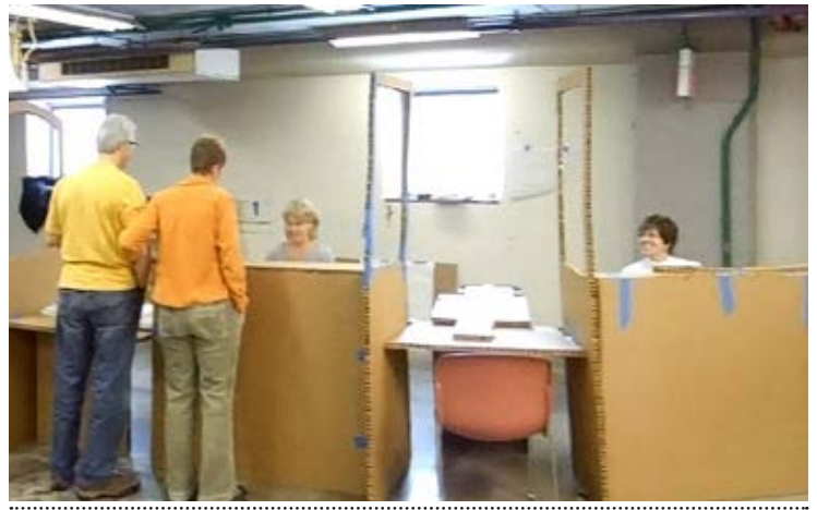
Team simulating a reception design concept