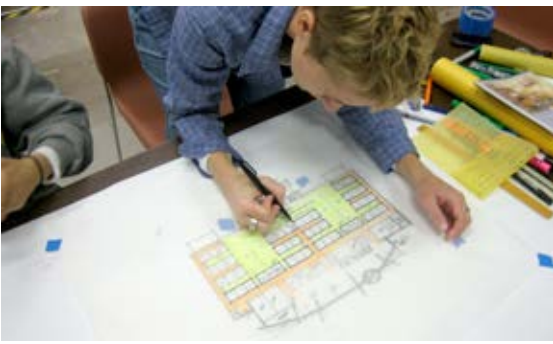
Design concepts developed and modified on site