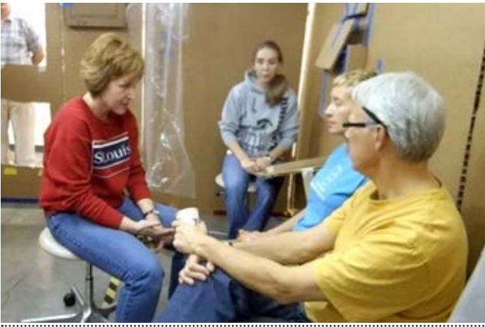
Team simulating patient visit in exam room