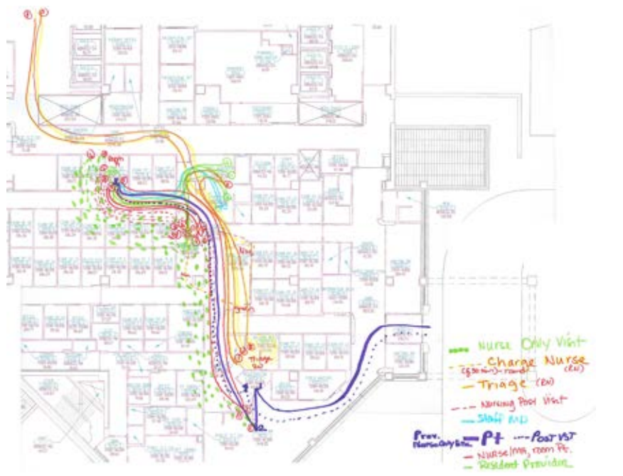
Spaghetti diagrams measuring travel distances by users

“ The 3P event was by far the most valuable exercise that I have every participated in, and I believe the efforts of the 3P will save us months of design time. We modeled the clinic based entirely on the patient experience, and made significant improvements in this process. It was also a wonderful team-building experience.”